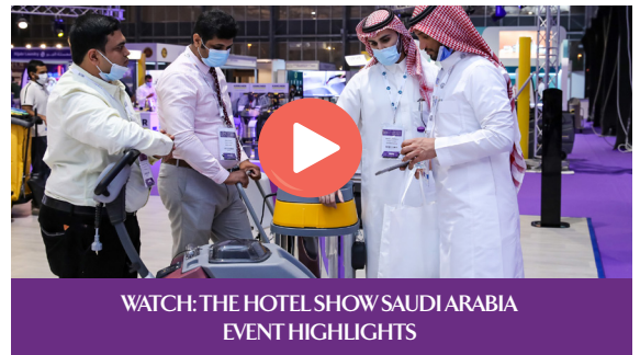
WATCH: THE HOTEL SHOW SAUDI ARABIA EVENT HIGHLIGHTS

The challenge gathered eight hotels battling against each other by putting forward their top chefs to showcase exemplary cooking styles, creativity and share culinary expertise in a live kitchen environment.